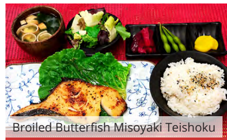
Broiled Butterfish Misoyaki Teishoku