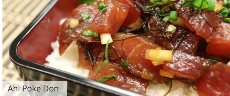
Ahi Poke Don

Thinly sliced Scottish Salmon sashimi garnished with white sweet onion, masago and Teishoku's ponze sauce