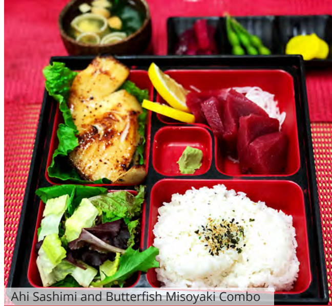
Ahi Sashimi and Butterfish Misoyaki Combo