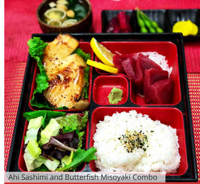
Ahi Sashimi and Butterfish Misoyaki Combo