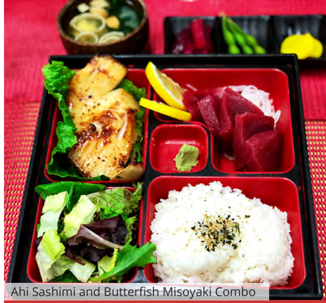
Ahi Sashimi and Butterfish Misoyaki Combo