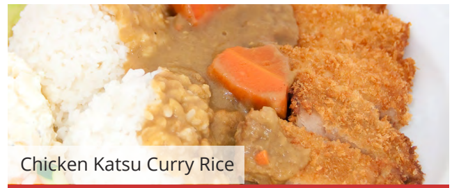
Chicken Katsu Curry Rice

Chirashi Don ちらし丼 ..... $19.75 Hawaiian Bigeye Tuna, Japanese Hamachi, Scottish salmon and salmon roe over rice