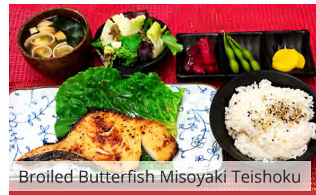
Broiled Butterfish Misoyaki Teishoku

Served with salad(sesame dressing), appetizers, rice (sush rice mixed w/sushi vinegar, white or brown rice) and miso soup. サラダ、前菜、ご飯(お寿司、白米 又は 玄米)、お味噌汁付き