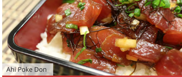
Ahi Poke Don

Sweet Onion with Salmon サーモンオニオン ..... $11.95 Thinly sliced Scottish Salmon sashimi garnished with white sweet onion, masago and Teishoku's ponze sauce