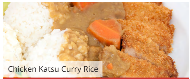
Chicken Katsu Curry Rice

Chirashi Don ちらし丼 ..... $19.75 Hawaiian Bigeye Tuna, Japanese Hamachi, Scottish salmon and salmon roe over rice