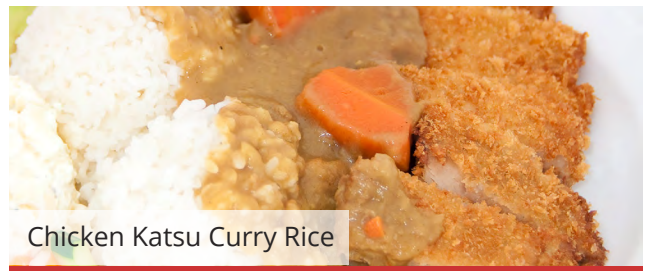
Chicken Katsu Curry Rice

Chirashi Don ちらし丼 ..... $19.75 Hawaiian Bigeye Tuna, Japanese Hamachi, Scottish salmon and salmon roe over rice