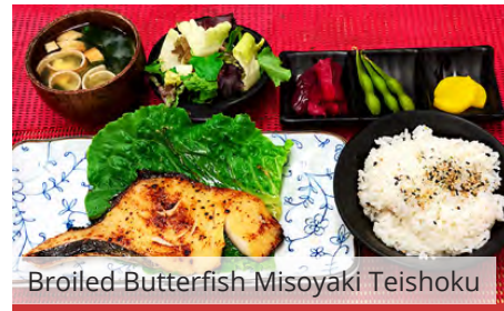
Broiled Butterfish Misoyaki Teishoku

Served with salad(sesame dressing), appetizers, rice (sush rice mixed w/sushi vinegar, white or brown rice) and miso soup. サラダ、前菜、ご飯(お寿司、白米 又は 玄米)、お味噌汁付き