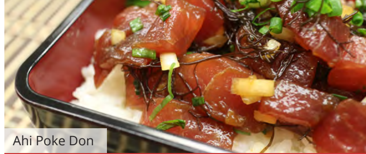
Ahi Poke Don

Sweet Onion with Salmon サーモンオニオン ..... $11.95 Thinly sliced Scottish Salmon sashimi garnished with white sweet onion, masago and Teishoku's ponze sauce