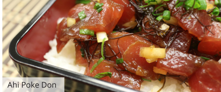
Ahi Poke Don

Thinly sliced Scottish Salmon sashimi garnished with white sweet onion, masago and Teishoku's ponze sauce