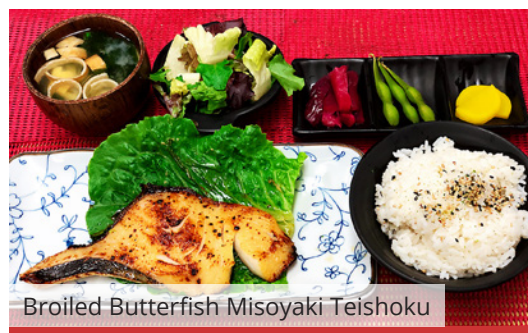
Broiled Butterfish Misoyaki Teishoku

Served with salad(sesame dressing), appetizers, rice (sush rice mixed w/sushi vinegar, white or brown rice) and miso soup. サラダ、前菜、ご飯(お寿司、白米 又は 玄米)、お味噌汁付き