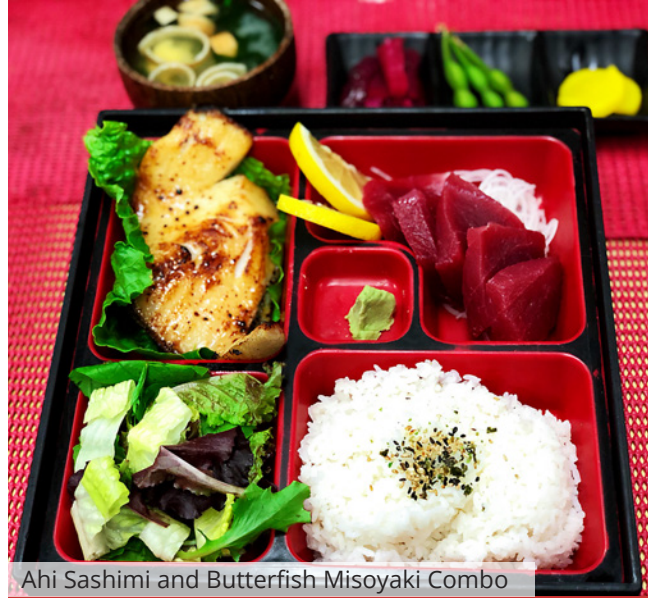
Ahi Sashimi and Butterfish Misoyaki Combo