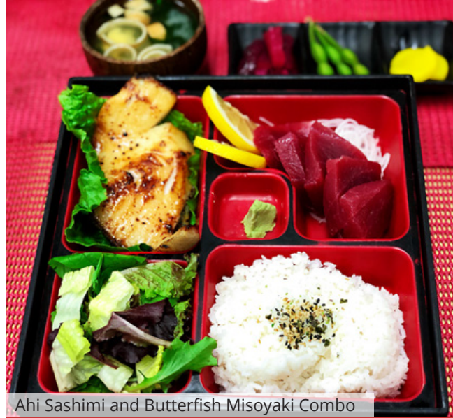
Ahi Sashimi and Butterfish Misoyaki Combo