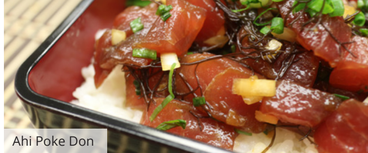
Ahi Poke Don

Hawaiian Bigeye Tuna 5pcs and Japanese Sea Urchins 18g