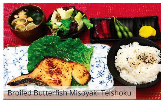
Broiled Butterfish Misoyaki Teishoku

Served with salad(sesame dressing), appetizers, rice (sush rice mixed w/sushi vinegar, white or brown rice) and miso soup. サラダ、前菜、ご飯(お寿司、白米 又は 玄米)、お味噌汁付き