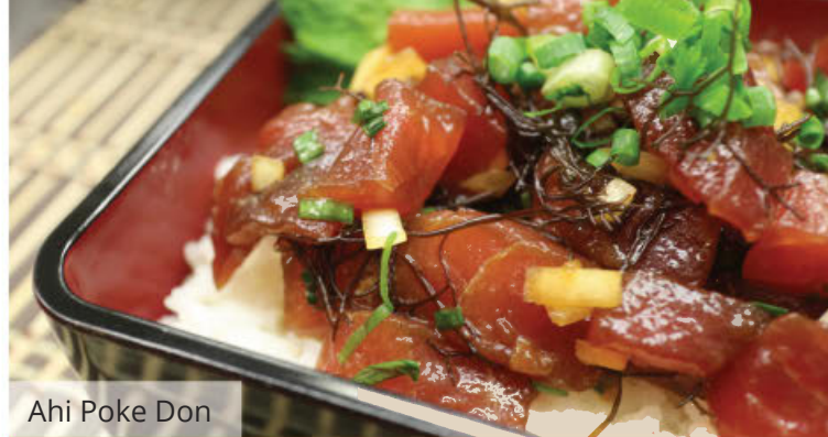
Ahi Poke Don

Thinly sliced Scottish Salmon sashimi garnished with white sweet onion, masago and Teishoku's ponze sauce