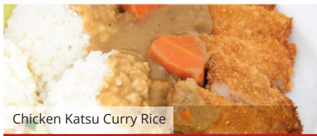
Chicken Katsu Curry Rice

Hawaiian Bigeye Tuna, Japanese Hamachi, Scottish salmon and salmon roe over rice