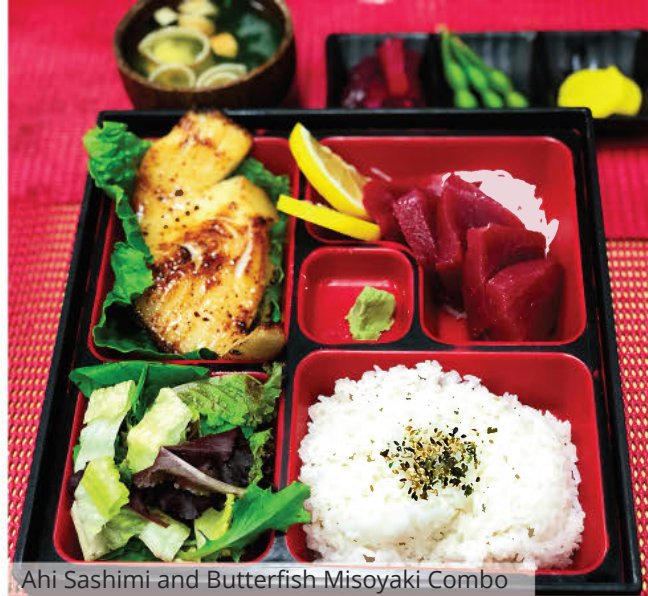
Ahi Sashimi and Butterfish Misoyaki Combo